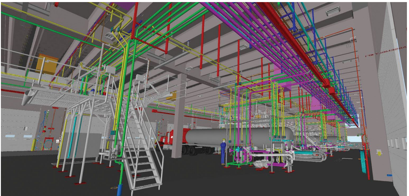
An Autodesk Navisworks in-progress model shows building and piping in the receiving area.

Utilizing technology embraced by the entire design team, Shambaugh created a federated model from all design trades and performed real-time clash detection that was effectively carried through to piece detailing, production, and erection of precast concrete; installation of pipe racks and equipment; and ultimately the tie-in among all the various equipment, utility, and building components. The use of this technology