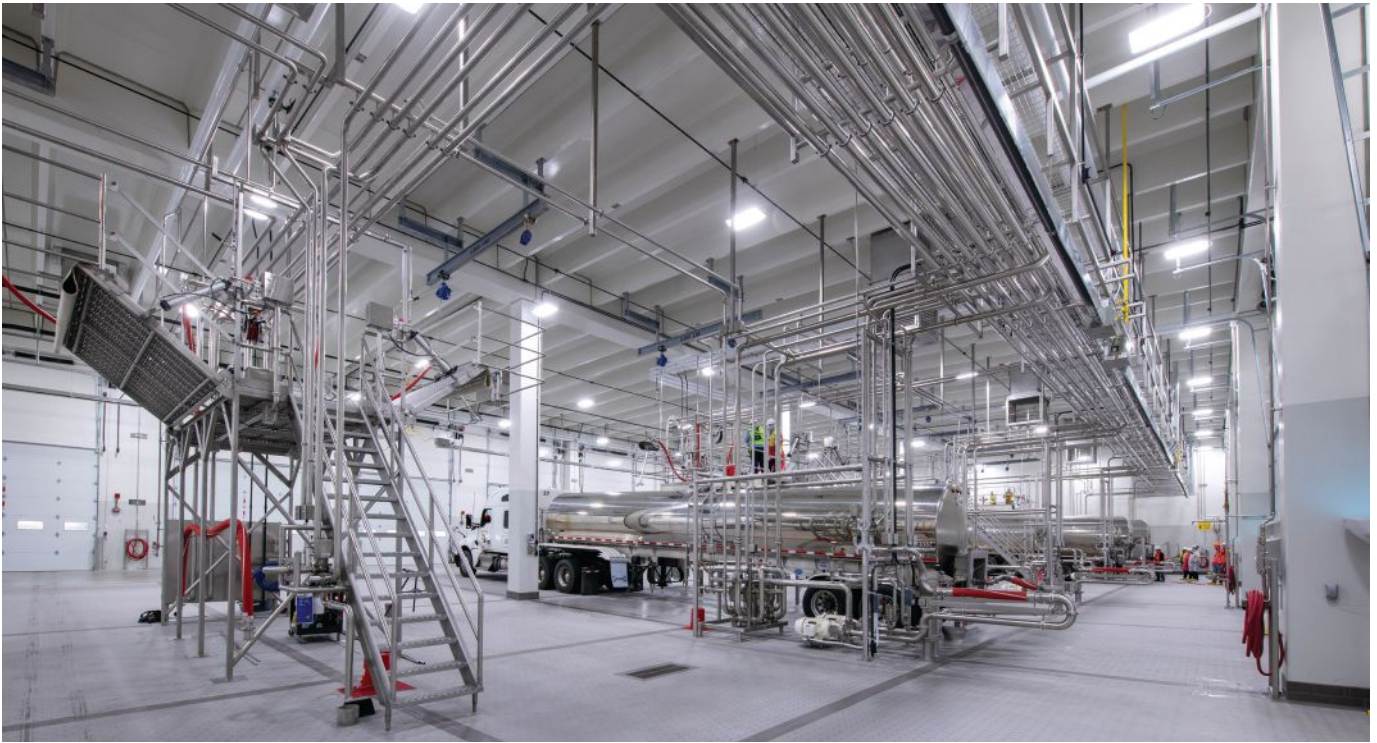
The final in-place construction is shown for the building and piping in the receiving area.

prevented human error during the analysis of interferences across all trades.