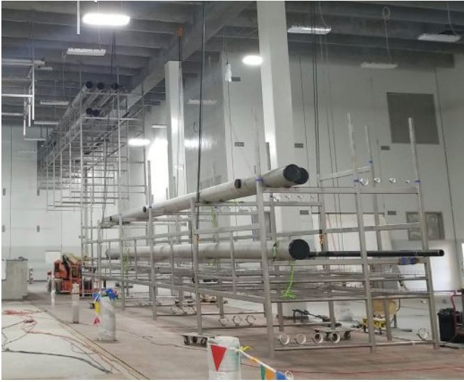
A 50 ft long pipe rack is staged for lifting in the morning. Note: 1 ft = 0.305 m.