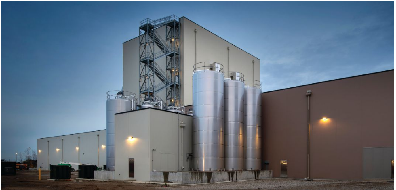
The MWC LLC processing facility dryer structure is constructed of precast concrete.

a finished surface that is durable, free of voids, smooth, resistant to chemicals, and easy to wash down.